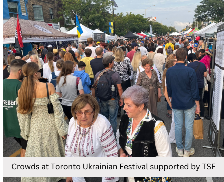
Crowds at Toronto Ukrainian Festival supported by TSF